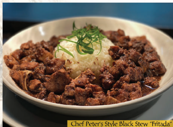
Chef Peter's Style Black Stew "Fritada"

Customary 10% service charge will be added to your bill for parties of 11 or less and 15% for parties of 12 or more.