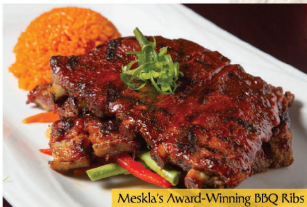
Meskla's Award-Winning BBQ Ribs