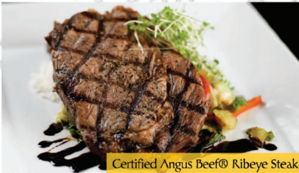
Certified Angus Beef® Ribeye Steak

*Salmon: $12 | *Grilled Prawns (3pcs): $12 | Lobster Tail: $20