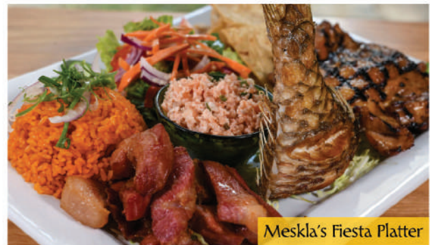
Meskla's Fiesta Platter

BBQ chicken, smoked pork, fried reef fish, kelaguen, coconut milk stewed spinach, and titiyas (please note that the reef fish may vary from time to time)