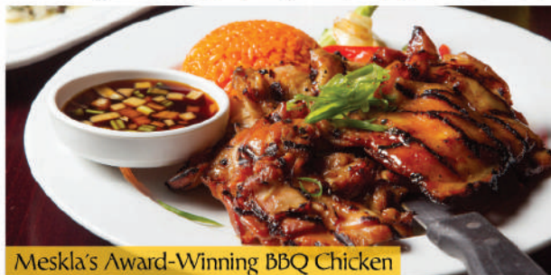
Meskla's Award-Winning BBQ Chicken

BBQ Short Ribs: $10 | BBQ Chicken $6 | Smoked Pork $7