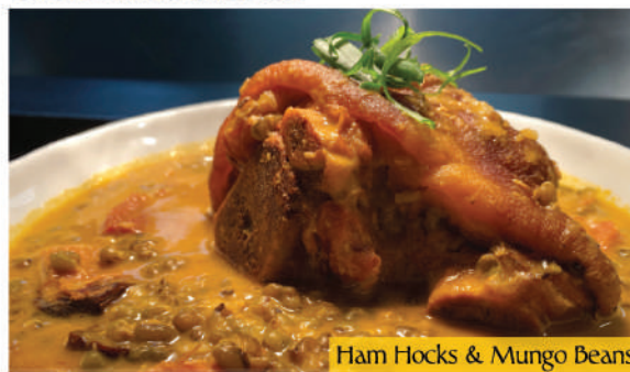
Ham Hocks & Mungo Beans

Local style achiote laced mungo beans with coconut milk and tender ham hocks, served with steamed rice