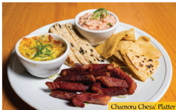
Chamoru Chesa' Platter

Customary 10% service charge will be added to your bill for parties of 11 or less and 15% for parties of 12 or more.