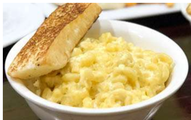
Macaroni & Cheese $9.95 Served with garlic toast

Customary 10% service charge will be added to your bill for parties of 11 or less and 15% for parties of 12 or more.