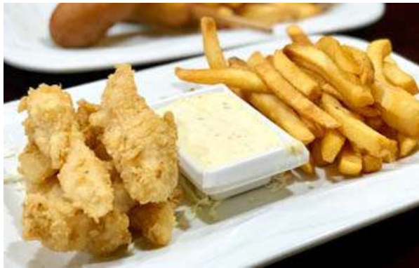
Fried Fish Nuggets $9.95 Served with french fries or rice