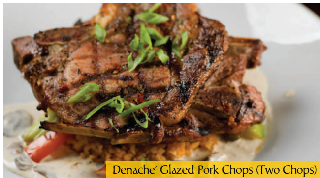
Denache' Glazed Pork Chops (Two Chops)

Customary 10% service charge will be added to your bill for parties of 11 or less and 15% for parties of 12 or more.