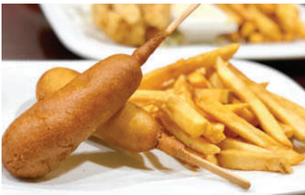
Nathan's Corn Dog $8.50 Served with french fries or rice