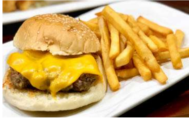
Kids Cheeseburger $9.50 Served with french fries