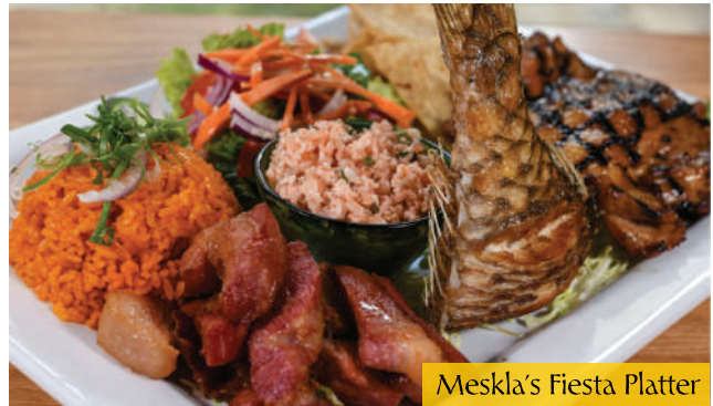
Meskla's Fiesta Platter

BBQ chicken, smoked pork, fried reef fish, kelaguen, coconut milk stewed spinach, and titiyas (please note that the reef fish may vary from time to time)