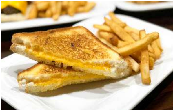
Grilled Cheese Sandwich $8.50 Served with french fries