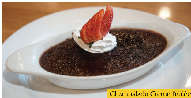
Champãladu Crème Brûlée

Meskla brings you back into grandma's kitchen with this dessert, local style chocolate rice porridge infused with a rich and creamy chocolate custard, finished off with the traditional caramelized sugar crust