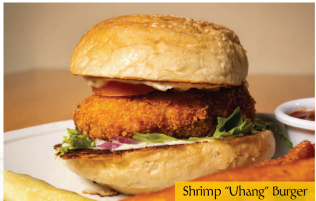
Shrimp "Uhang" Burger

Housemade 6oz shrimp burger dusted in panko crumbs, fried to golden finish and topped with our tartar sauce