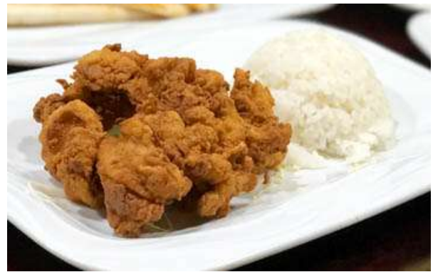
Chicken Nuggets $9.95 Served with french fries or rice