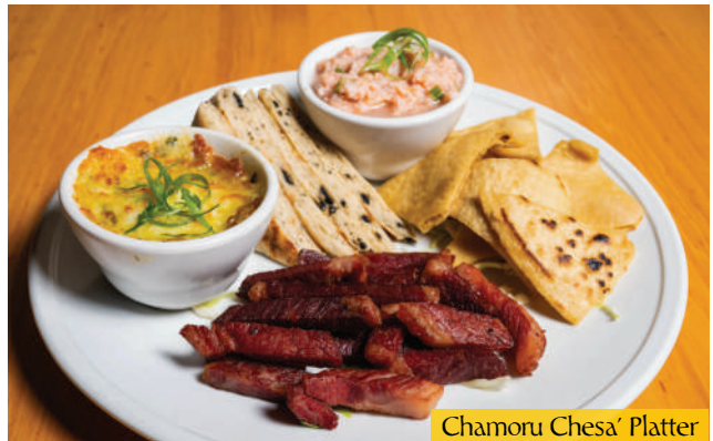
Chamoru Chesa' Platter

Chicken $6 | Calamari $7 | Ahi Poke $8 Salmon $10 | Prawns $10