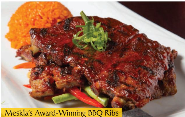
Meskla's Award-Winning BBQ Ribs

A tender half rack of St. Louis ribs, basted in our spicy award-winning BBQ sauce and grilled to perfection