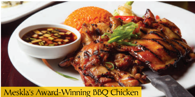
Meskla's Award-Winning BBQ Chicken

BBQ Short Ribs: $10 | BBQ Chicken $6 | Smoked Pork $7