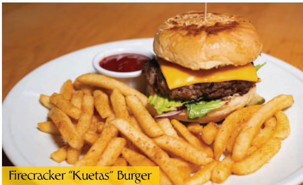
Firecracker "Kuetes" Burger

Housemade 8oz patty grilled to order and served in a fresh sesame bun with spicy house dinanche' aioli