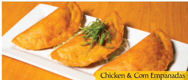
Chicken & Corn Empanadas

Chicken and Corn Empanadas $13.25 Rice, chicken and sweet corn stuffed and sealed in an achiote tortilla and fried to a crispy finish (3pcs)