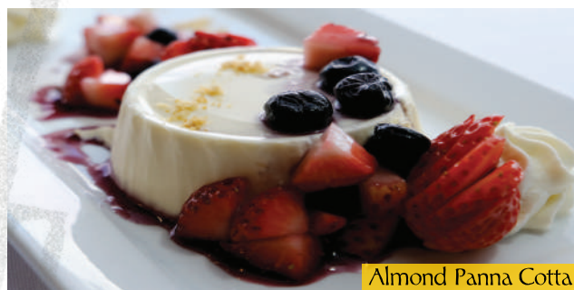
Almond Panna Cotta

A silky gelatinized almond flavored sweet cream topped with a tangy berry compote